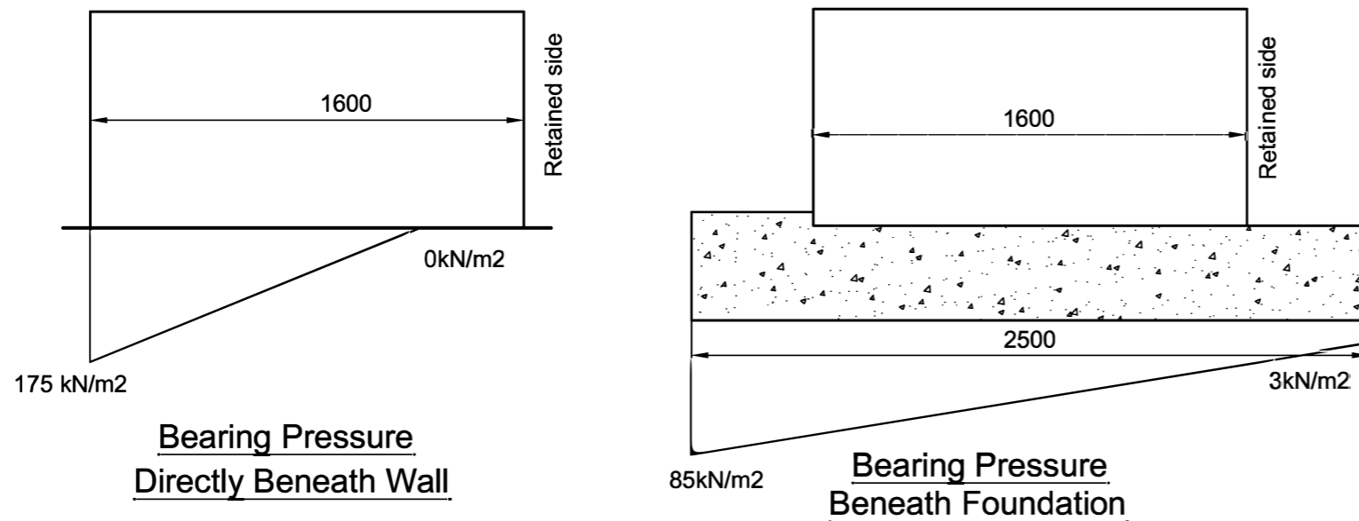
Bearing Pressures (1:25)

NOTE:- The bearing pressure beneath the wall is shown below. An indicative foundation is shown. The foundation is a Contractor Designed Element. It is up to the client to ensure the ground and foundation is adequate.