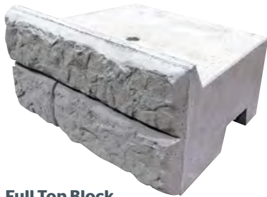
Full Top Block