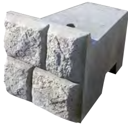
Half Top Block