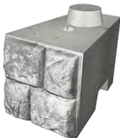
Half Middle Block 1