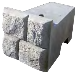
Half Top Block