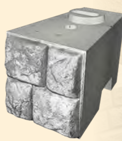
Half Middle Block 2