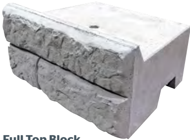
Full Top Block